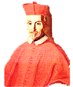
St Gregory Barbarigo