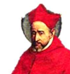
St Charles Borromeo