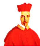
St Gregory Barbarigo

EVANGELIZATION: That priests, through the modesty and humility of their lives, commit themselves actively to a solidarity with those who are most poor.